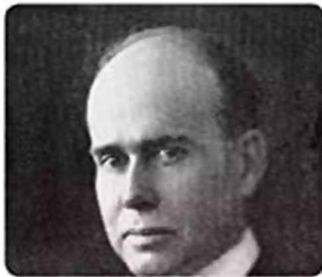
CLIFFORD WHITTINGHAM BEERS

Have you ever pondered upon the intricate workings of your mind? How it shapes your reality, emotions, and perceptions? The human mind is a labyrinth of complexities that constantly astound and baffle us. In Dewey's classic memoir, "Mind That Found Itself," we embark on a transformative journey alongside a man