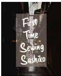
Everything You Need To Know About Sewing Sashiko

Now that you have learned everything you need to know about how to sew Sashiko, it's time to pick up your needle, thread, and fabric and embark on your Sashiko journey. Let your imagination soar and create beautiful Sashiko pieces that reflect your personal style and passion for the craft!