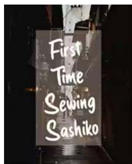
Everything You Need To Know About Sewing Sashiko

Sashiko, meaning "little stabs" or "little pierce," has a long history that dates back over 400 years. Originally, it was developed as a functional embroidery technique, mainly used for darning, repairing, and reinforcing layers of clothing and textiles.